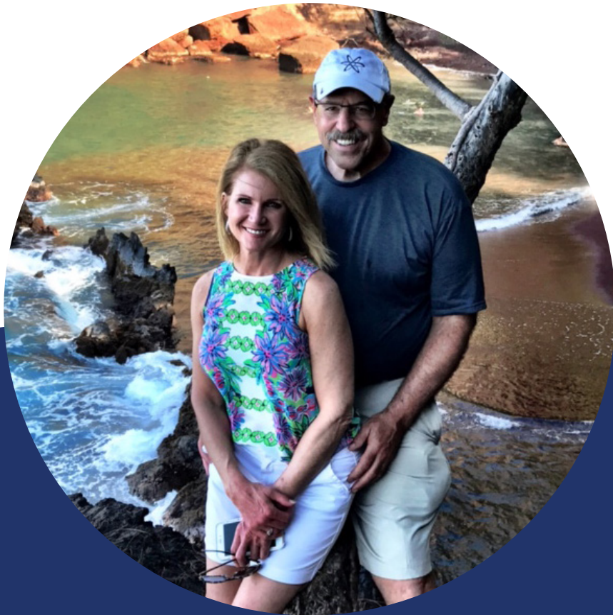
Photo submitted by Gregg from Connecticut , valued annuity customer since 2015 .