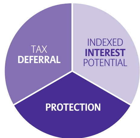
The 3 benefits of a fixed index annuity in a retirement strategy

Because the value of the index you choose may vary daily and is not predictable, the interest you earn can be more – or less – than the interest you'd receive from a traditional fixed annuity. Many fixed index annuities also let you allocate premium to a traditional fixed interest option, where interest is credited at a fixed rate.